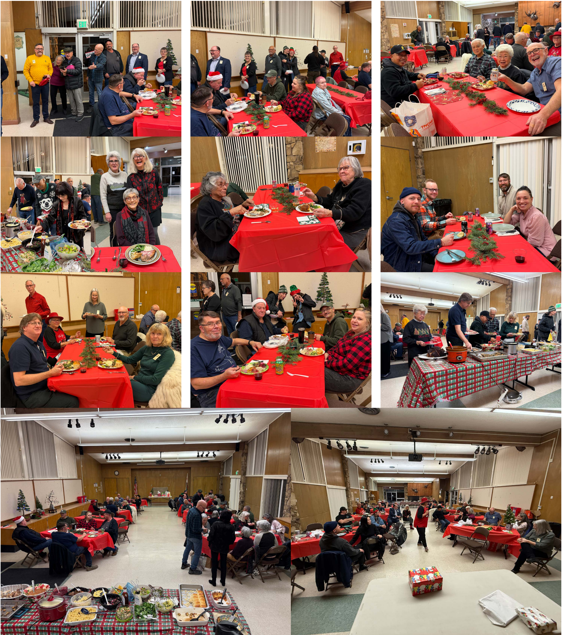
Above: Scenes from the 2025 Holiday Party

Merriment, socializing, and dining proceeded throughout the evening. The best decorated bonsai tree was selected by the group after eating concluded. Finally, the gift exchange occurred, but this year we opted to allow the stealing of a gift up to three times, so there were some fun antics as giftees opted to steal gifts from one another. As always, it was a great opportunity to spend an evening with our fellow small tree enthusiasts.