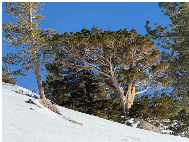
High-elevation pine and juniper

As time marches onward, another year presents another bonsai cycle and another opportunity to hone our skills. This time of year can sometimes feel like a lull in bonsai work, especially with wet weather, but winter is the season of repotting and silhouette work. While repotting is a distinct skill, it requires a broader perspective of the individual tree and project. More literally, you cannot just repot in a vacuum. Any tree beyond the most immature stage of development is asking us to commit to the basic composition: to choose the front, the main trunk line, the primary branch position and distribution, the orientation of the nebari, the angle. This can be changed later, and often it is, but we are also trying to reduce the time horizon between now and the completed tree. Being non committal about the design runs the risk of delaying arrival at a completed design. There is no way around it: bonsai is a long term commitment and many trees take 10-15 years to reach development with perfect decision making along the way. So, I'll keep it brief. Please take the time to read this newsletter and then go out and get busy! You have decisions to make.