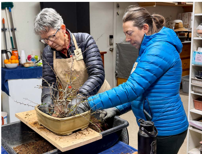
Scenes from the January member workshop