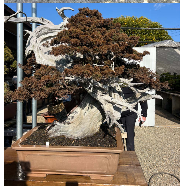
Garden of Kimura san