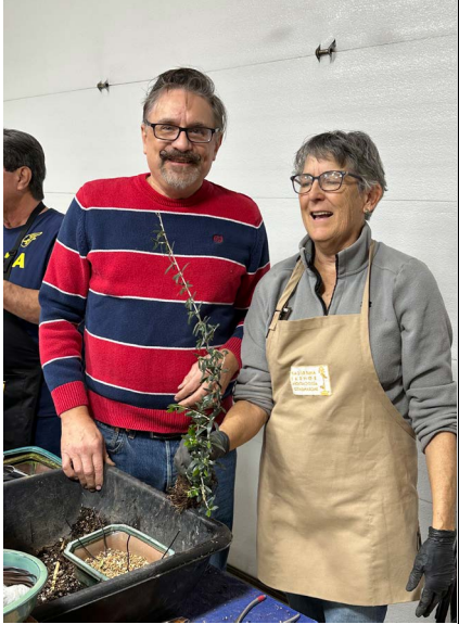
Above: Shots from the Jan workshop