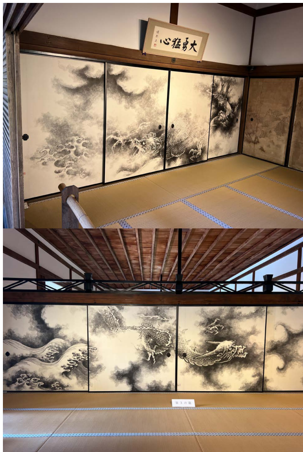
Gorgeous dragon panels at a sub-temple in Daitoku ji temple complex