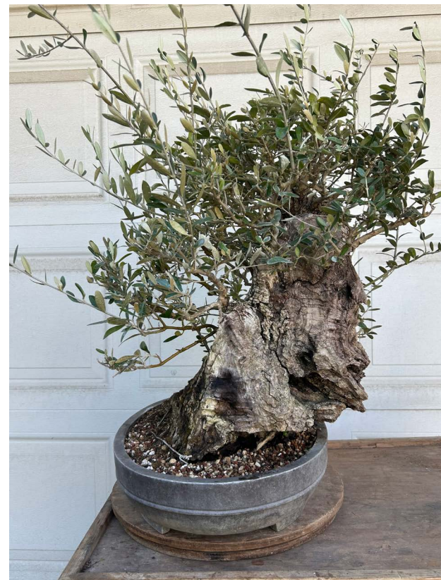
Above: This olive could be yours in the March raffle - and it's a big boy at over 20" tall!