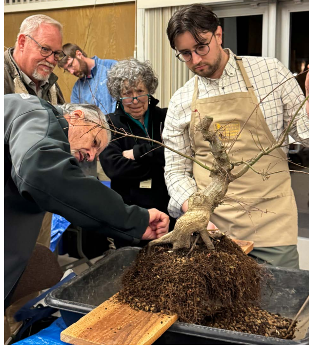
Above: Scenes from the January grafting workshop