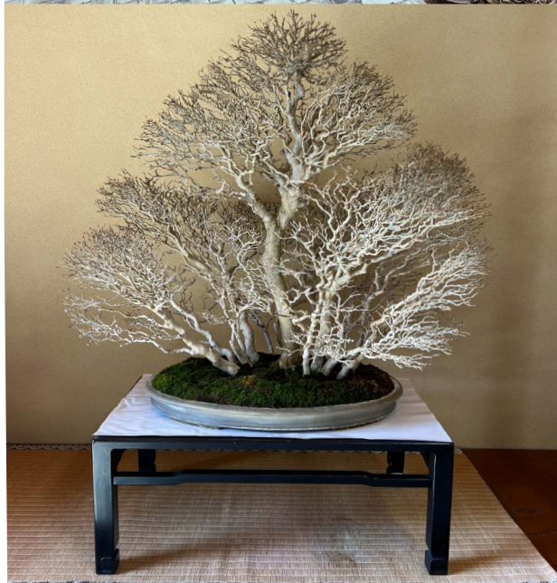
Shunkaen Bonsai Museum & Garden of Kobayashi san