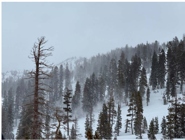
Above: Nature's bonsai - trees receiving their winter pruning and wiring by snow and wind.