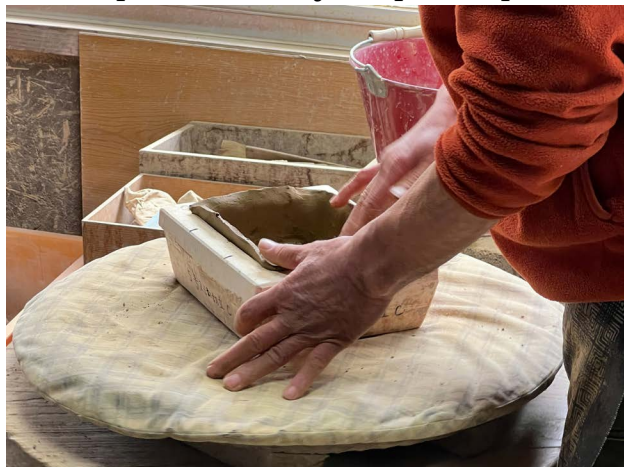
Kataoka san (Reiho) at work