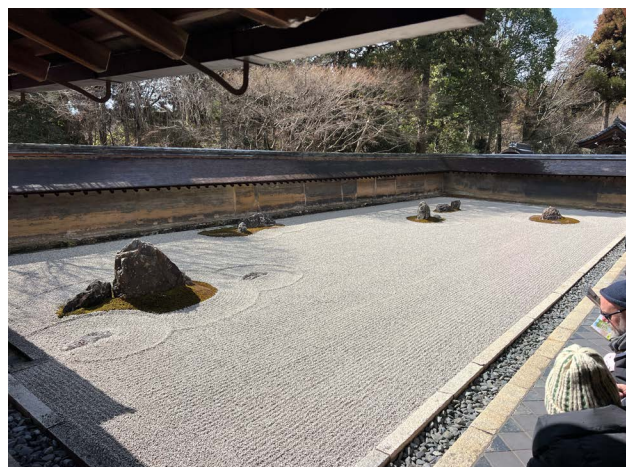
The famous rock garden at Ryoan ji temple

Also, dormant sprays are no longer useful as trees push out of dormancy. Enjoy the lull in pest activity before the heat comes, but keep your eyes out!