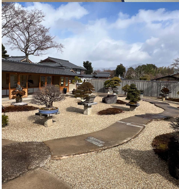
New Kyoto Bonsai Garden at the Hoshun'in sub-temple in Daitoku ji temple complex