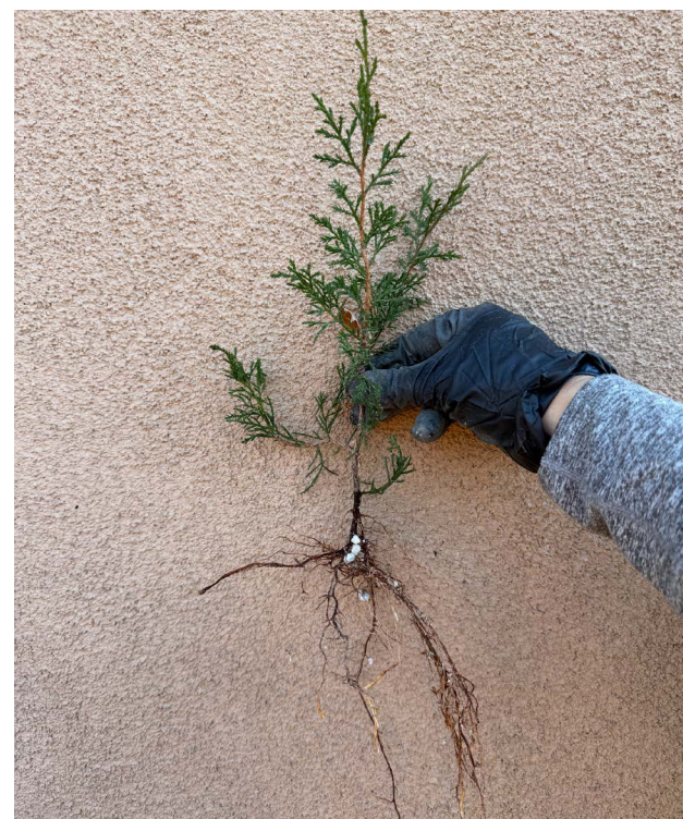
Above: Do it, you know you want to! It’s great to have a flat of rooted shimpaku at hand for group, slab, and rock plantings - or anything your heart desires. Plus it’s satisfying.